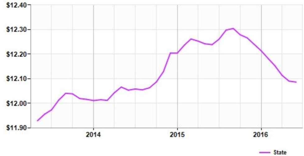
Asking Rent Retail for Lease Joplin, MO ($/SF/Year)